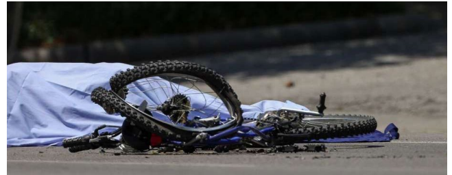
Houston Police officers investigate the scene where a bicyclist was fatally struck by a dump truck on the intersection of South Main Street and Sunset Boulevard Tuesday, April 24, 2018, in Houston.