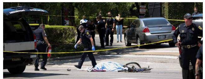
Houston Police officers investigate the scene where a bicyclist was fatally struck by a dump truck on the intersection of South Main Street and Sunset Boulevard Tuesday, April 24, 2018, in Houston.